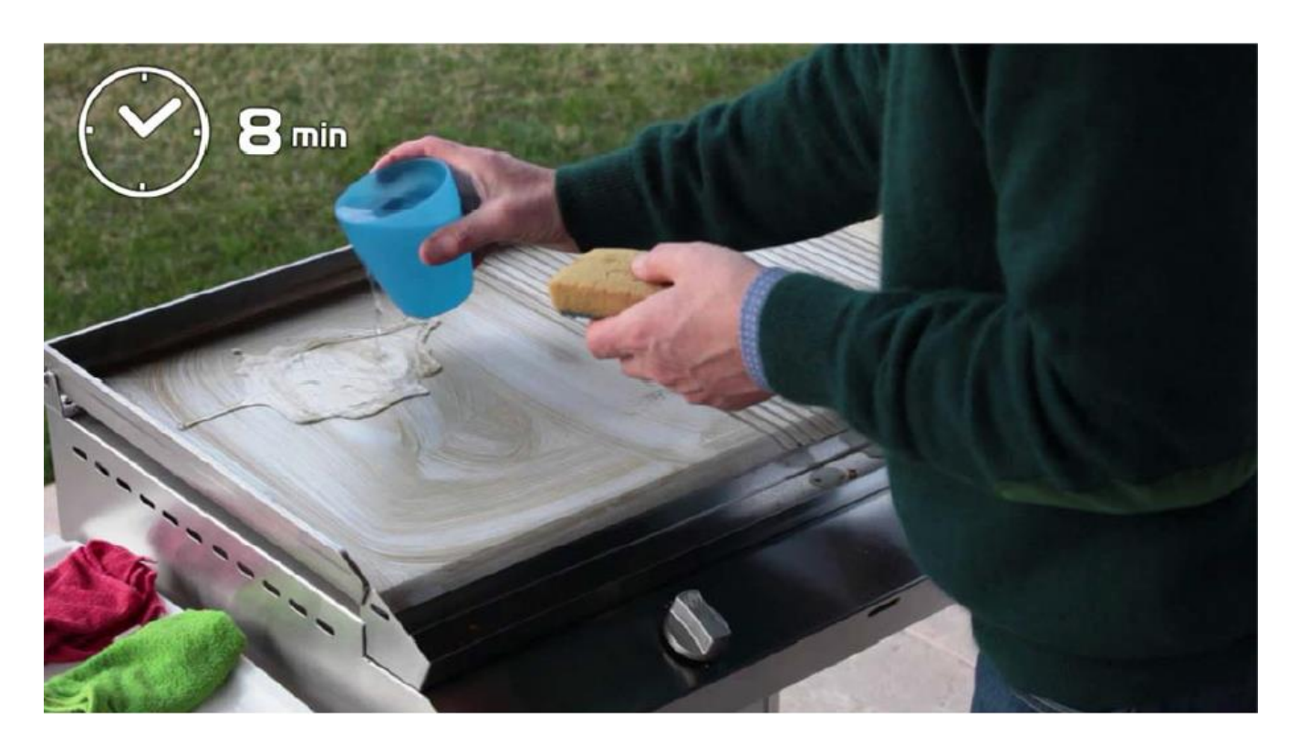
Rinse the plate with water